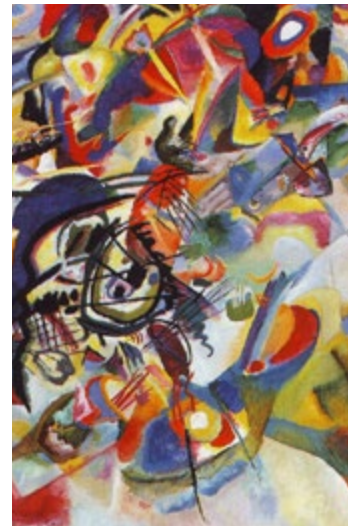
Composition VII (1913)

Wassily Kandinsky Painter, Educator, Lawyer (1866–1944)