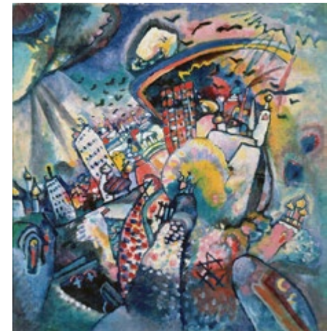
Moscow I (Red Square) (1916)