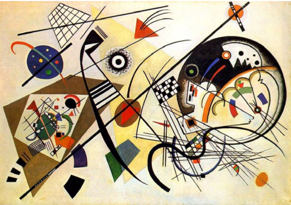
Transverse Line, 1923